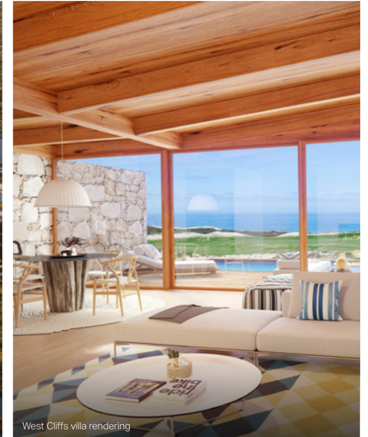
West Cliffs villa rendering

Portugal's far south is renowned for its exclusive golf communities, but the country's Atlantic coast is adding an exciting new dimension to the Iberian golf landscape.