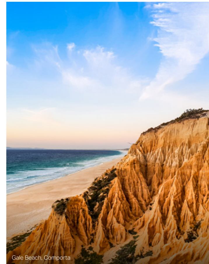
Gale Beach, Comporta

Though new-plot options are limited, real estate opportunities remain on the Algarve. The final areas of undeveloped land at the famous Quinta do Lago resort are at the One Green Way community and at North Grove, the latter of which has 13 sites available for custom luxury villas. Quinta do Lago offers 54 holes of great golf, as well as a Paul McGinley golf academy and enough restaurant options so that owners can eat somewhere different every night for a fortnight.