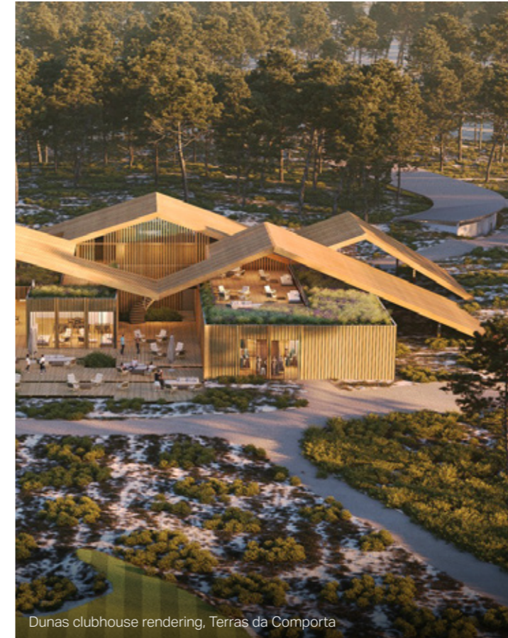
Dunas clubhouse rendering, Terras da Comporta